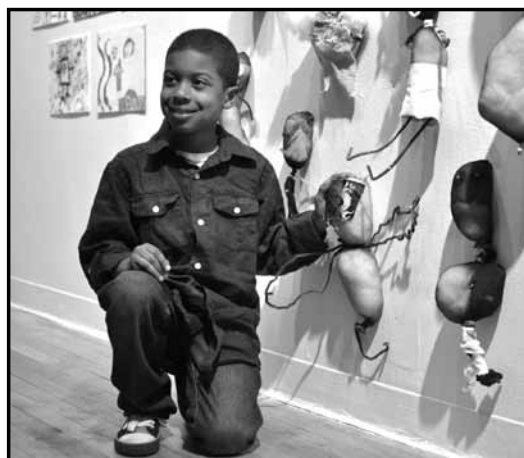
A Weekly Mentor Program participant from Union Settlement shows off his "Yinka Shonibare Fabric Sculpture."